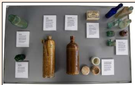
Top-down view of various artefacts, such as bottles, that have been found whilst building the Cross River Rail project

Building Brisbane’s new underground has meant digging deep in the city at a variety of locations. During excavation, demolition and removing rubble from worksites, a number of items of archaeological significance have been uncovered that reveal what life was like in Brisbane at the turn of the 20 th century at this location. At our October meeting, Dr Kevin