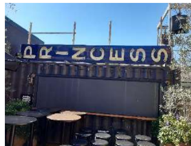
The original neon sign now "rests" in the rear courtyard