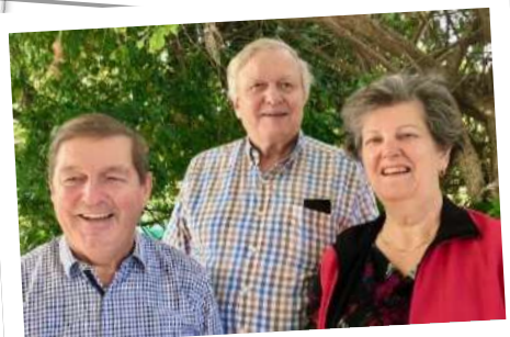
Some snaps of a few of the nearly 100 attendees at the August Meeting