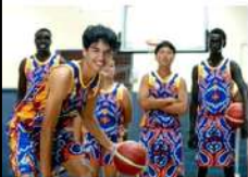
One of the slides from the presentation