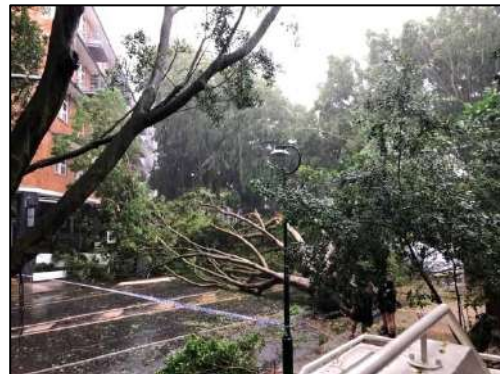
Macquarie Street near Dalgety's Bar

and our March newsletter was delayed by one week! But we were lucky compared to other regions which had devastating impacts.