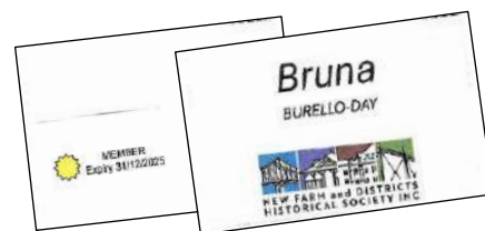
Back and front of name badge/membership card

If you have an earlier name badge, please bring that along and we will exchange the old one for the new one