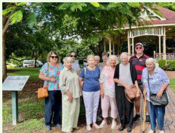
The group appreciating 'our' Bandstand