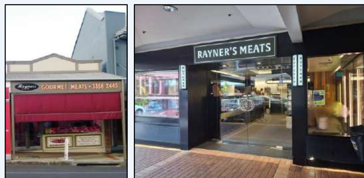
Then and Now – What a difference 100 years makes!

passed away just a few months later on 2 August 2023, aged 93, but the Rayner legacy and history will be remembered and preserved well into the future.