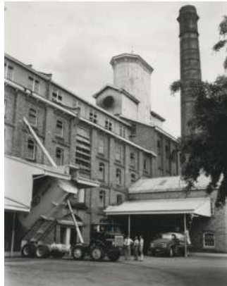
The CSR Refinery