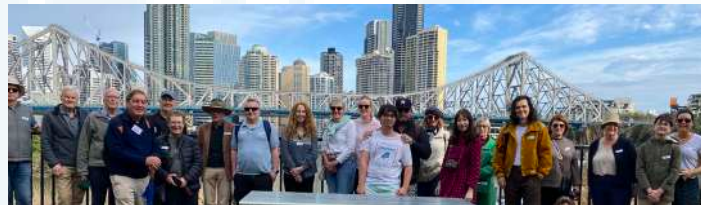
The diverse walking tour company