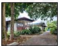
Brisbane City Council Use of the Ron Muir Meeting Room, New Farm Library